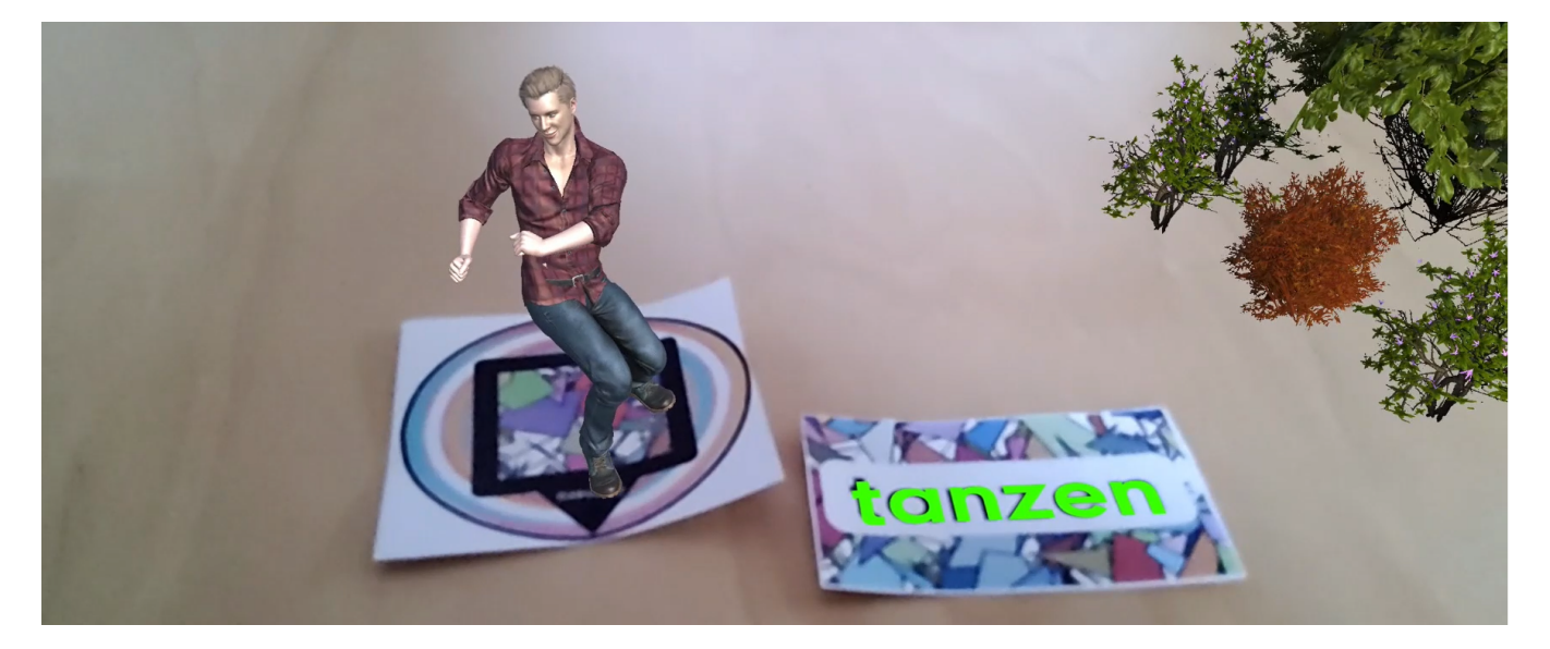
Figure 1: Screenshot of the Augmented Reality view with the flashcard tanzen . The avatar is displaying the animation of the presented verb together with the related emotion.

Michael Sedlmair University of Stuttgart Stuttgart, Germany michael.sedlmair@uni-stuttgart.de