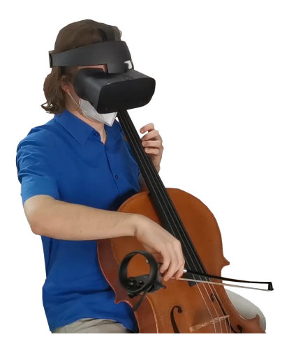
Figure 2: We currently track position and orientation of the bow through a VR controller fixed to it.

Work in the field of human-computer interaction addressed tasks such as assessing musicians' playing and providing respective feedback. Augmented reality, for instance, has been used to display information on drum kits [26] and guitars [13]. Let's frets! [14] uses LEDs and touch sensors on the fretboard to display and check exercises. Other approaches [10, 28] use sensor measurements in order to adapt the tempo or difficulty of exercises, or to allow users to